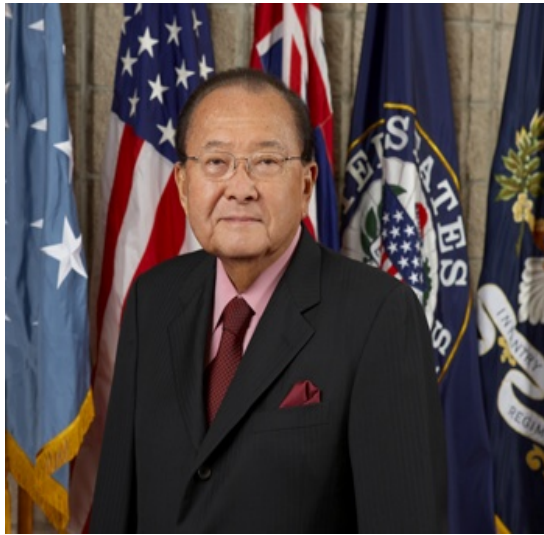
Sen. Dan Inouye (D-HI) - Chair