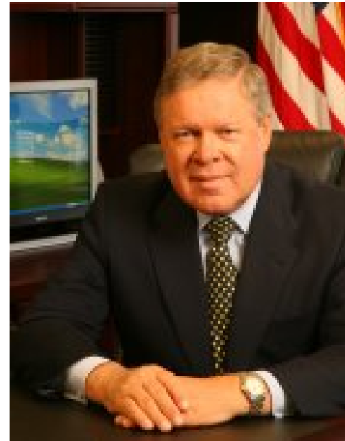
Rep. Norm Dicks (D-WA) – Ranking Member