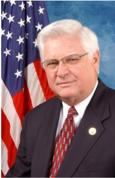
Rep. Hal Rogers (R-KY) - Chair